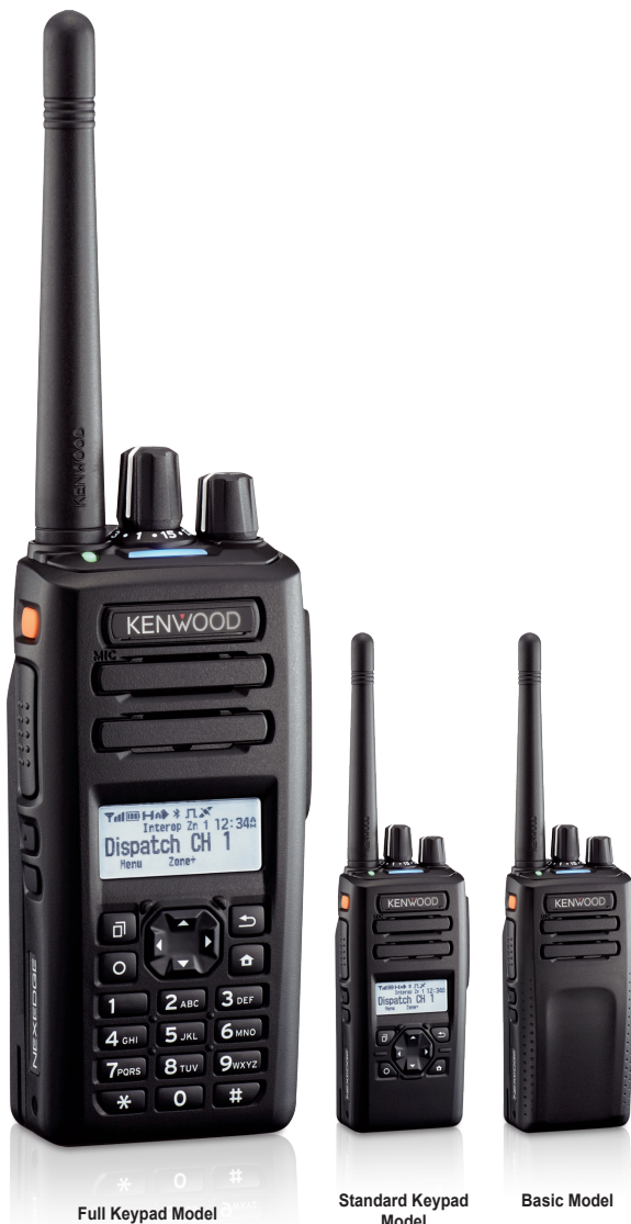
Full Keypad Model